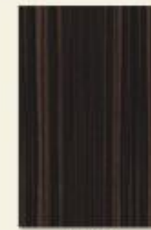
W 217 Real Ebony