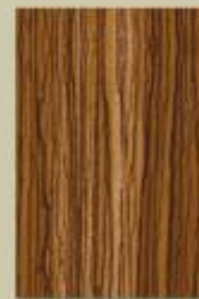
W 211 Zebrano