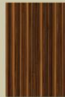
W 212 Oriental Ebony