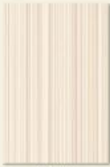
W 201 Beige Straight Pine