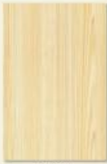
W 202 Maple