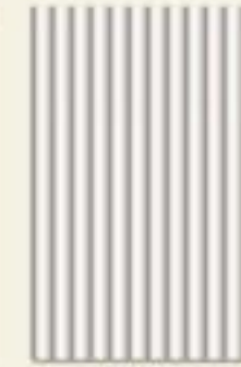
W 215 Highland Pine