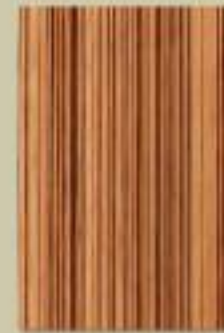
W 208 Rose Wood