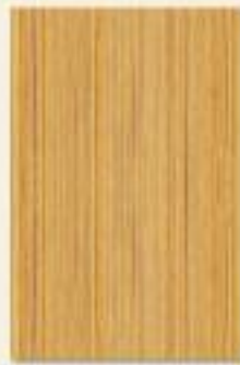
W 206 Scotts Pine