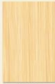
W 203 Cane