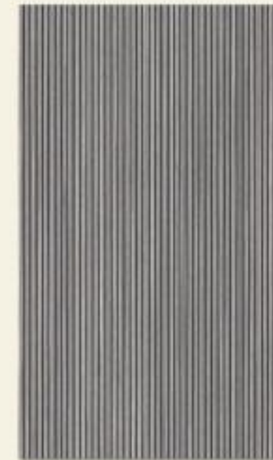
W 216 Larch Wood