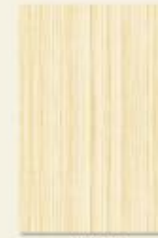
W 213 Light Oak