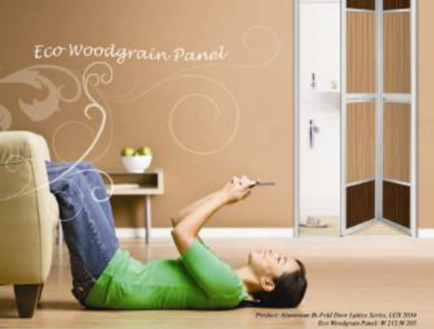
Product: Aluminium 6-Field Door Jambor Series, LUX 2014 Eco Woodgrain Panel: W 213 W 205