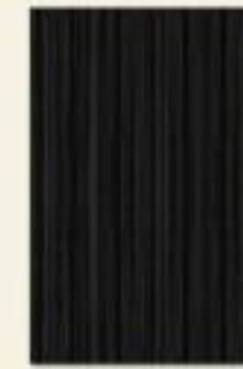
W 218 Makassar Wood