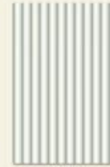
W 214 Highland Pine