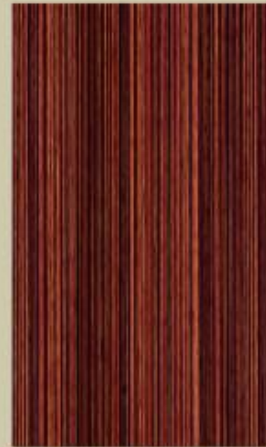
W 209 Zen Ash