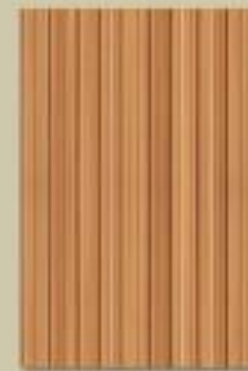
W 207 Amersato Oak

Achieve a natural ambiance using these finishes with a soft and delicate feel.