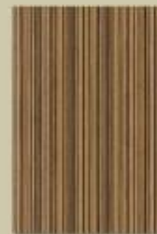
W 210 Deep Woods