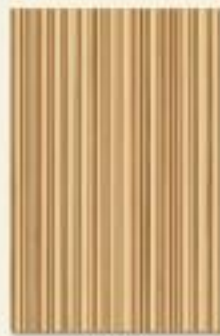
W 205 Zebra Wood